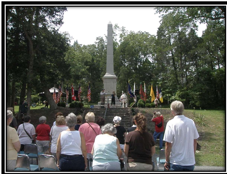
The Battle of Blue Licks Memorial Monument, Blue Licks Battlefield State Park, Kentucky

West Virginia-Battle of Point Pleasant Parade and Memorial held in Point Pleasant, West Virginia. This memorial is held in early October in remembrance of the Virginia Militia, who lost their lives in the Battle of Kanawha on October 10, 1774. The militia, under the command of Col. Andrew Lewis, was dispatched by Royal Governor Lord Dunmore, and fought Shawnee and Mingo warriors lead by Shawnee Chief Cornstalk, who was encouraged by the British at Fort Detroit to engage the militia. The NSSAR and DAR recognize this battle as the first battle between colonial troops and Great Britain.