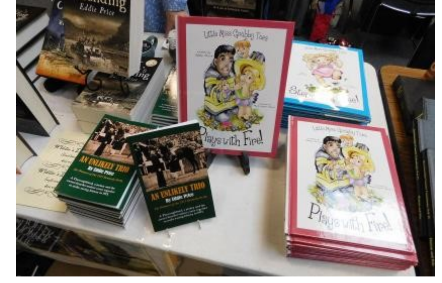
For a signed, inscribed copy of Eddie Price's One Drop--A Slave! , please send check for $32.76 (includes tax and shipping) to:

Eddie Price 175 Windsong Drive Hawesville, KY 42348