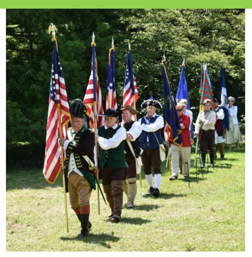
Sar members present colors.