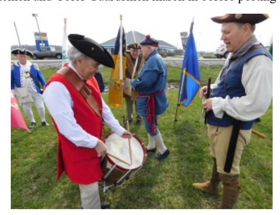
Fifers and Drummer before the ceremony.