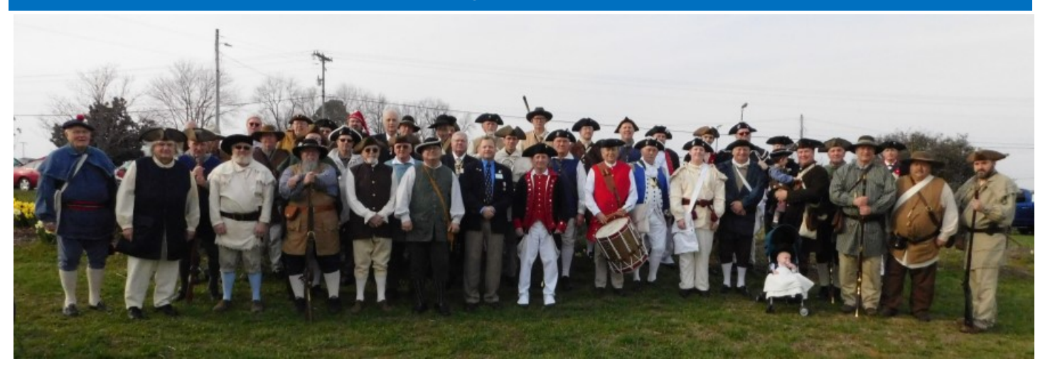
Kentucky Compatriots at the Cadiz, KY Patriot Grave Marking.