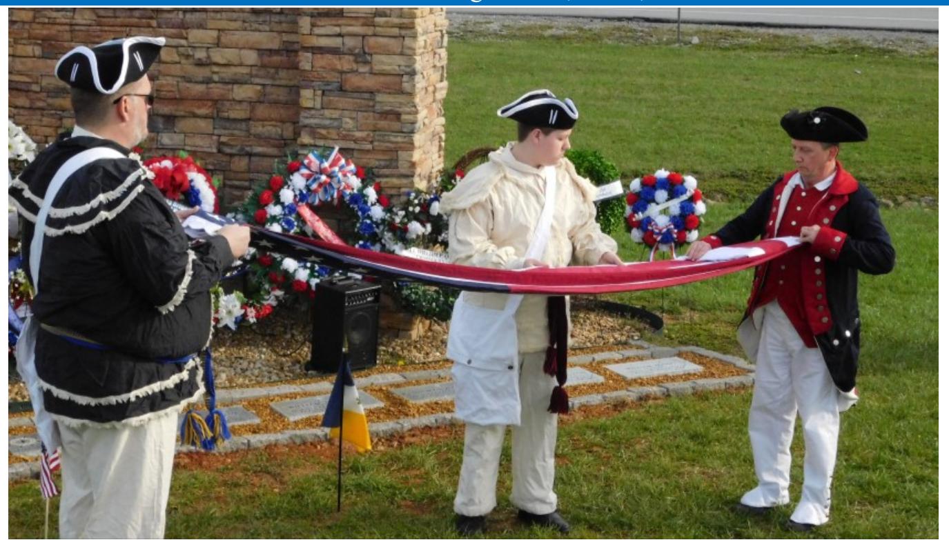
Flag folding ceremony.