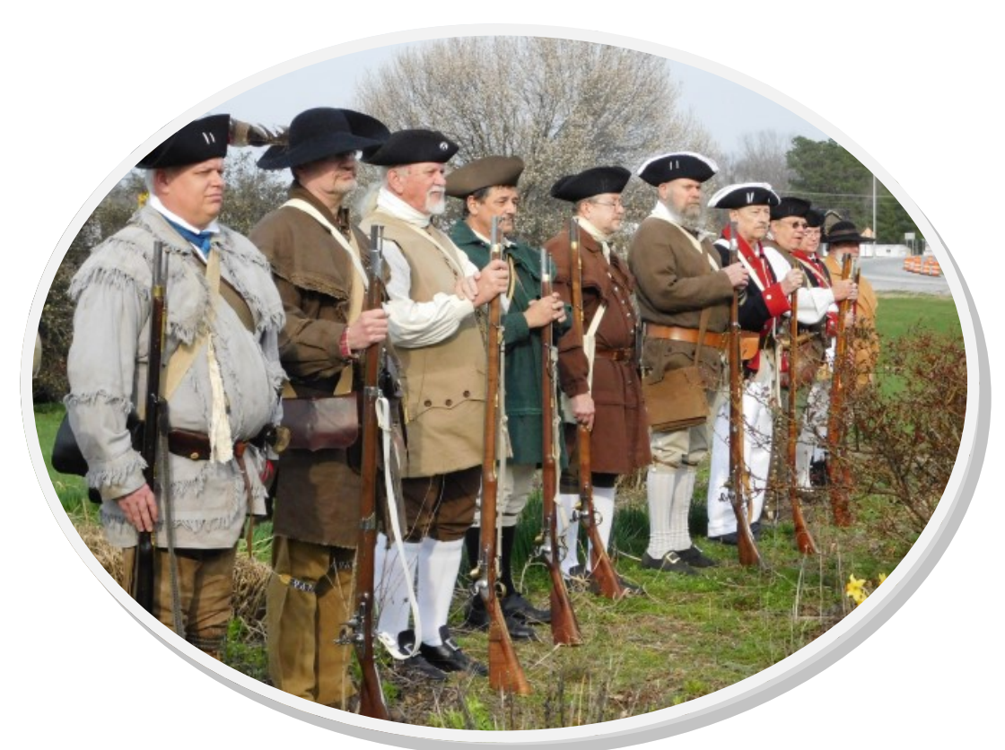
Riflemen prior to black-powder gun salute.