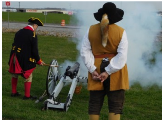
Cannons were fired during gun salute.