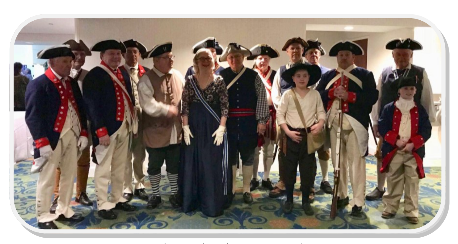
Kentucky Compatriots at the DAR State Convention.