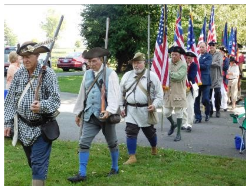
Members of the color guard.