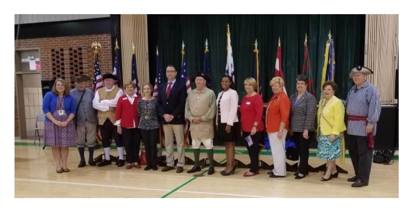
School officials and DAR members join the SAR members for a group picture.