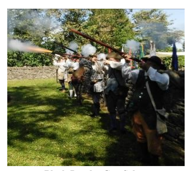
Black-Powder Gun Salute