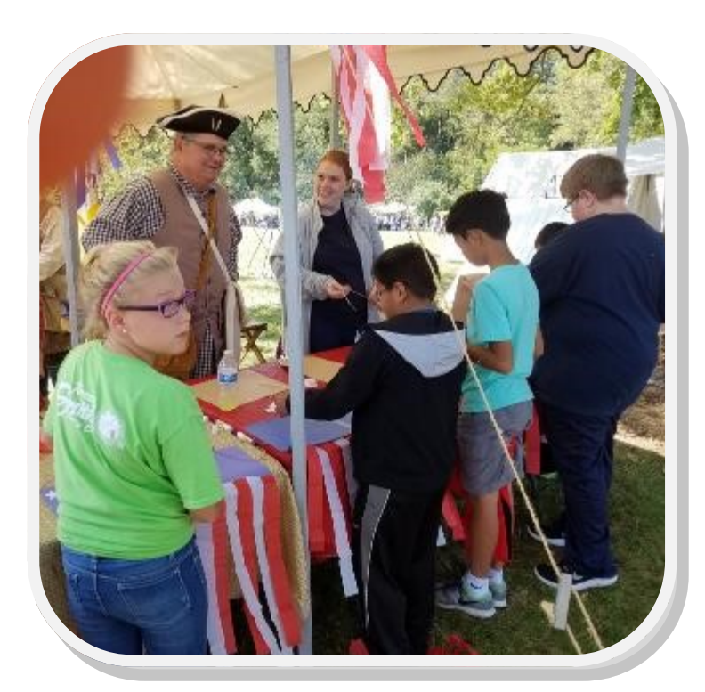
SAR Volunteers helped students make red, white and blue windsocks.