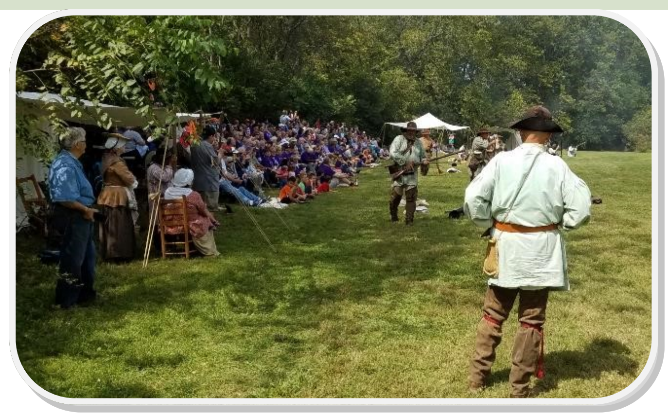
Apx. 700 school children watched a re-enactment of the Long-Run Massacre at the annual Painted Stone event.