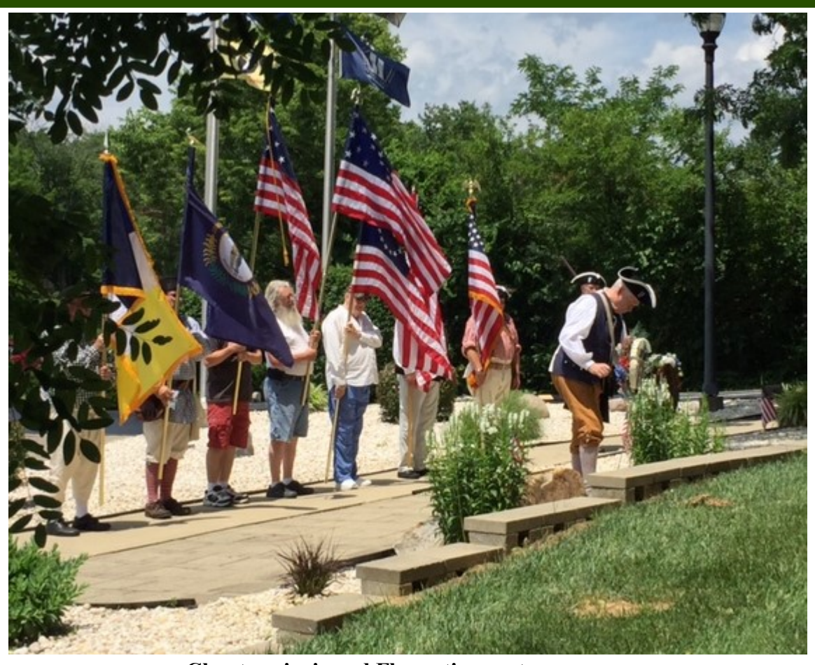
Chapter picnic and Flag retirement ceremony