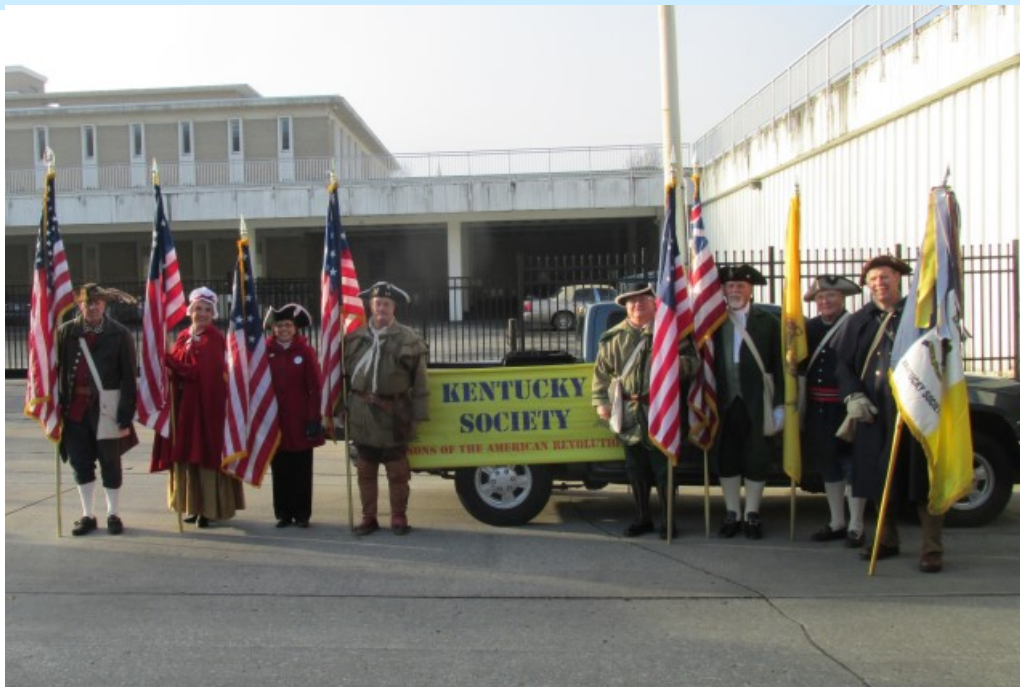
Sons and Daughters of the American Revolution marched together in the Inauguration Parade for Kentucky’s new Governor—Matt Bevin.