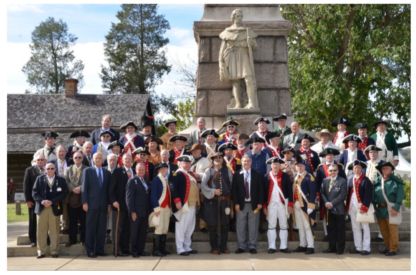
Compatriots at Point Pleasant, W.V.