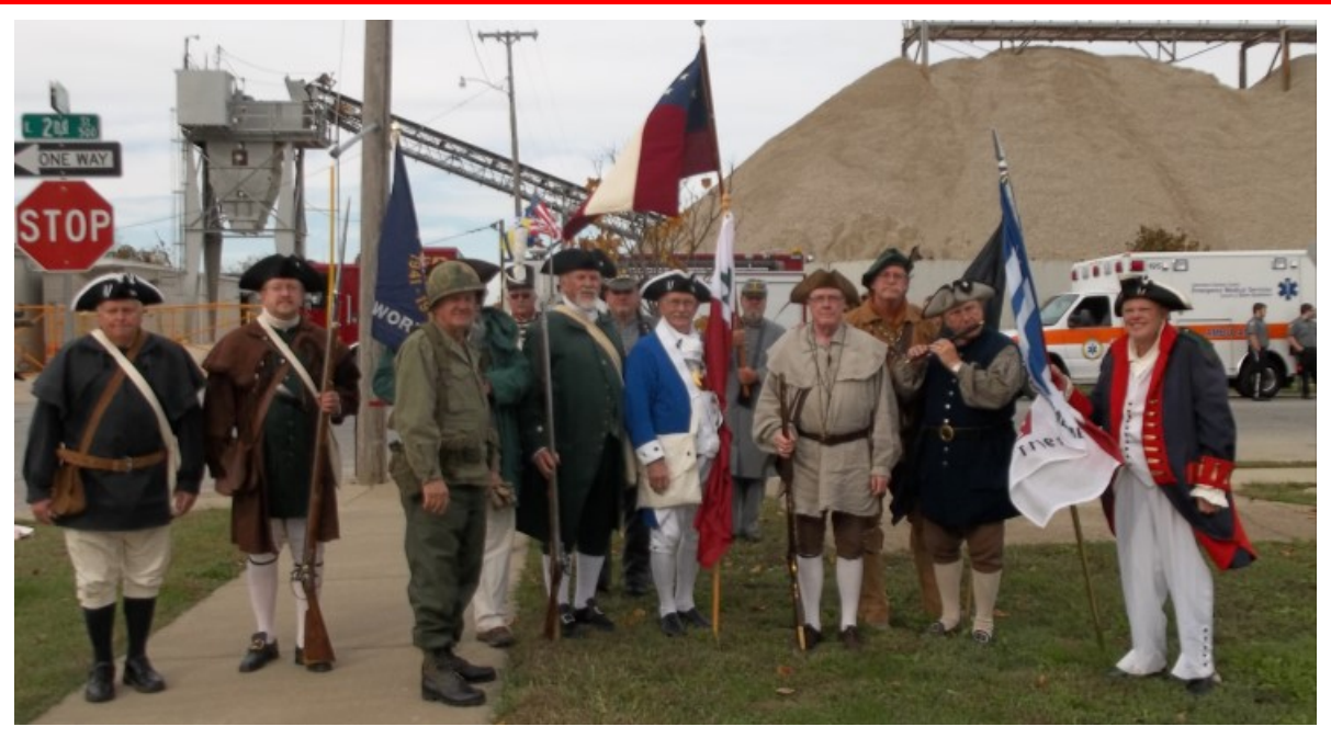
Compatriots from four chapters gather for the parade.