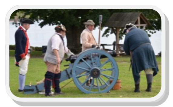
Cannon Crew at Point Pleasant