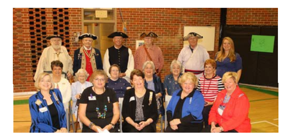
SAR & DAR Group picture.