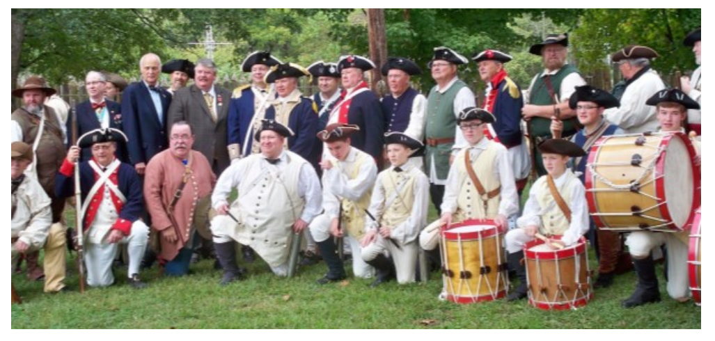
Compatriots at the Gathering at Sycamore Shoals.