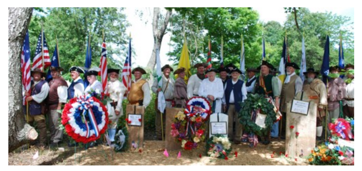
Group picture of those attending the Patriot grave marking ceremony at the historic Humphries Cemetery in rural Trigg County