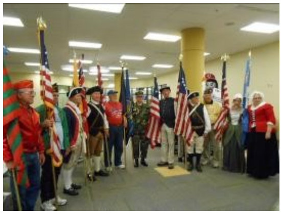
Chapter members at recent Honor Flight