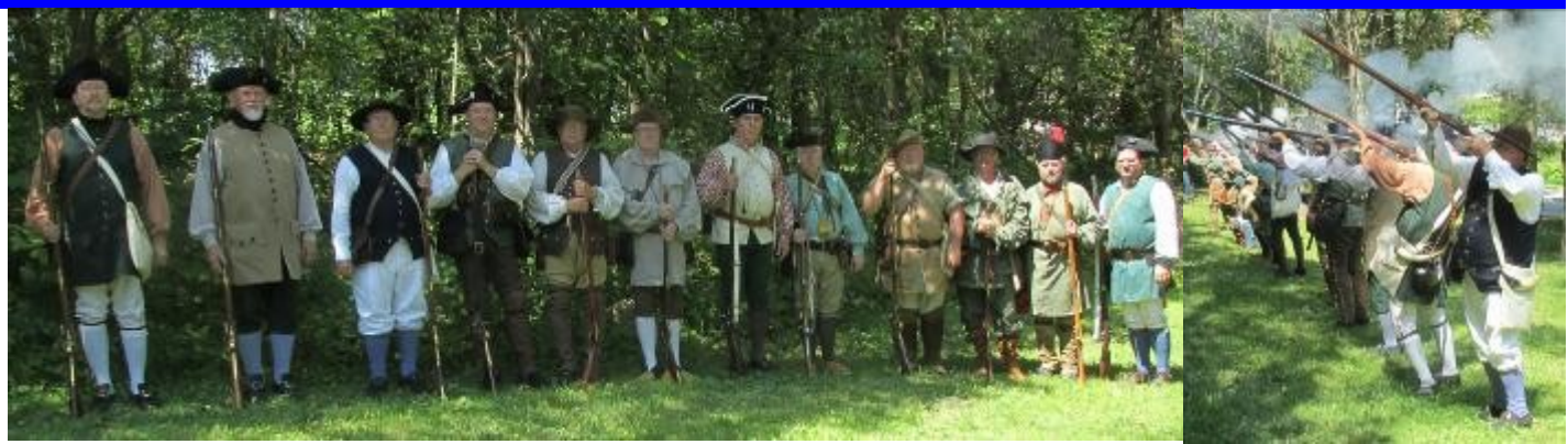
Riflemen from seven different chapters line up and fire a black-powder gun salute at the memorial service.