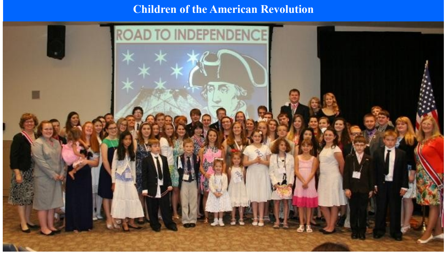
Group photo of the C.A.R. members at the Mid-Southern Regional Meeting in Erlanger, the total attendance for members and adults was 142.