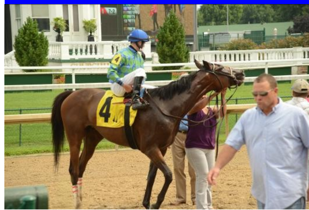
Thatcher Street (#4) winner of the Patriots Cup. Race sponsored by the Sons of the American Revolution.