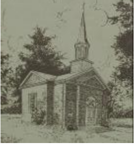
Lincoln Marriage Temple