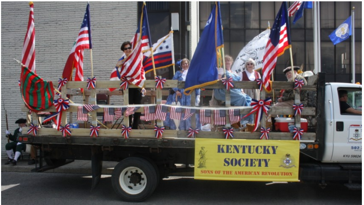
In addition to those that marched we had some who rode on our truck that was decorated with banners and flags.