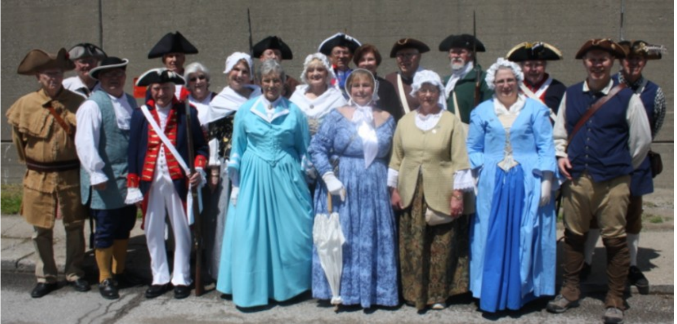
SAR and DAR members who took part in the Kentucky Derby parade.