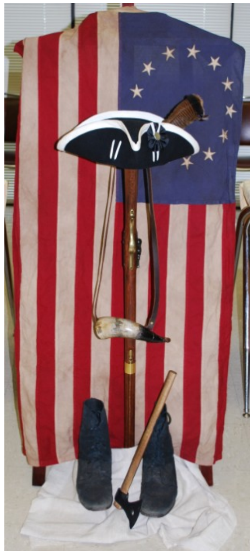
The Fallen Soldier Memorial Revolutionary War Expression

As he read the name of each and shared a brief biography, a representative of the sponsoring chapter came forward with SAR escort and presented a flower at the memorial.