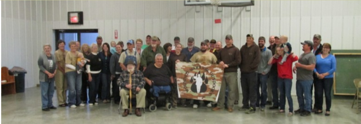
Wounded Warrior turkey hunt at Fredonia, KY