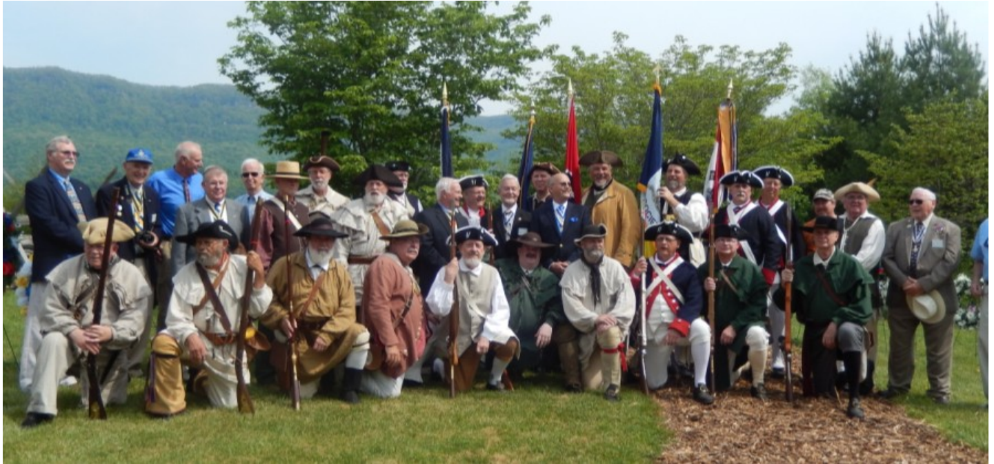
Group picture of Compatriots at Martin's Station anniversary.