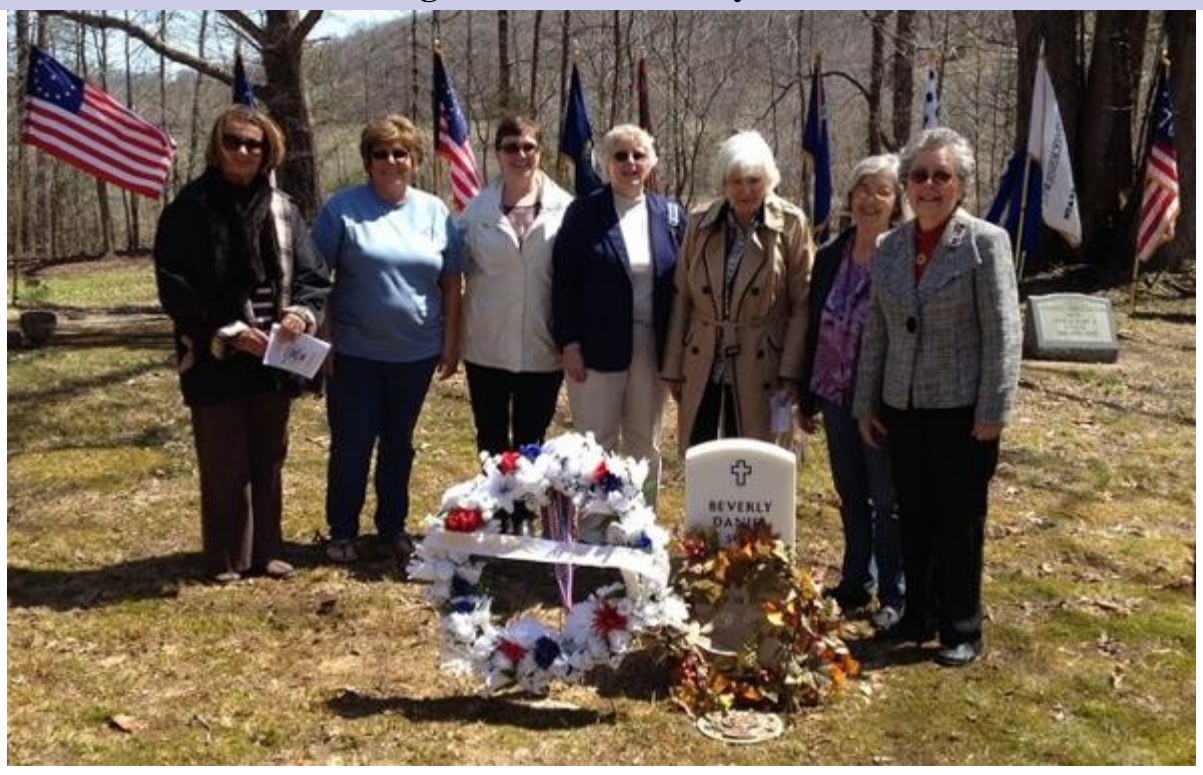
Most of the ladies in this picture are members of the Red River Valley Daughters of the American Revolution.