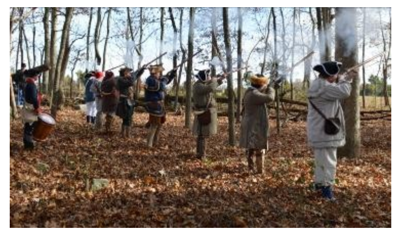
Black-powder gun salute.