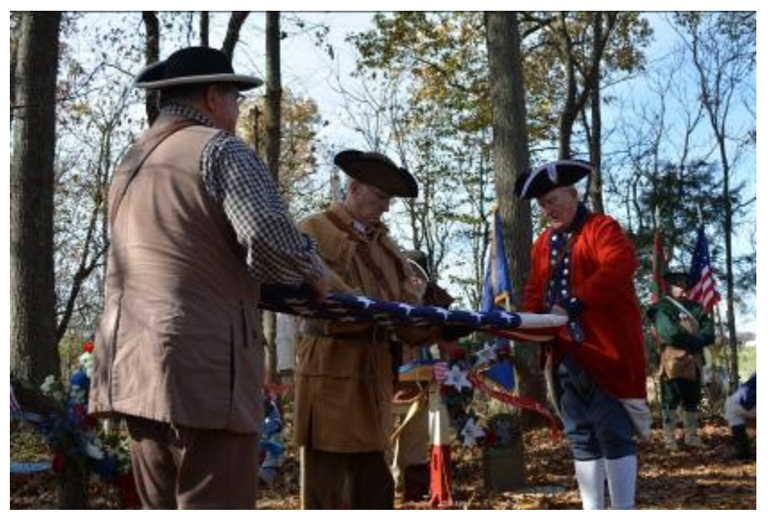
Flag folding ceremony