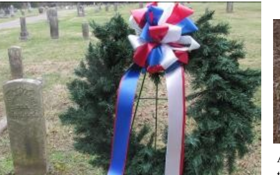
Slave, who fought in the Civil War, honored at the Pioneer Cemetery in Bowling Green.