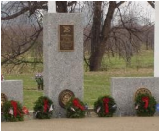
Wreaths at a Memorial for the different branches of service.