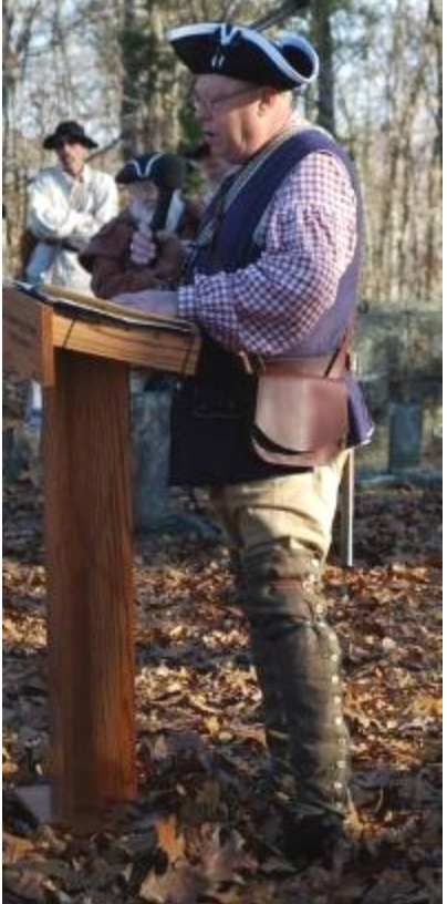
Compatriot talks about his Patriot ancestors.