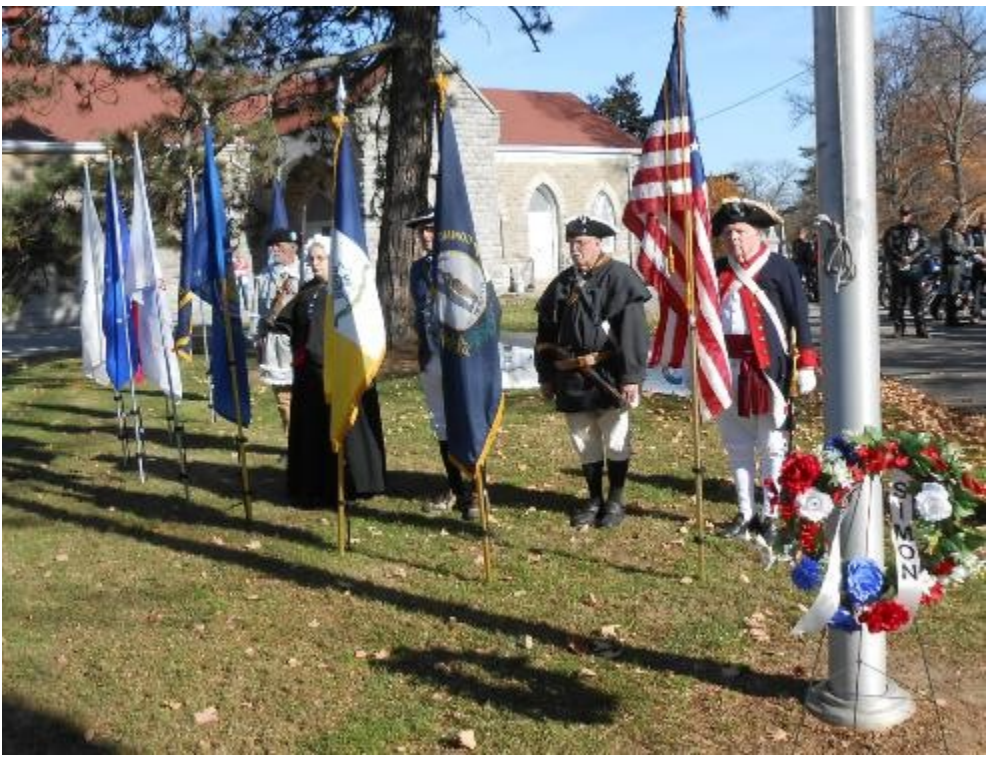
Simon Kenton Color Guard at a Veterans Day Ceremony at Highland Cemetery.