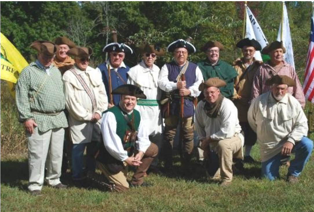
Compatriots of the Colonel Stephen Trigg Chapter.