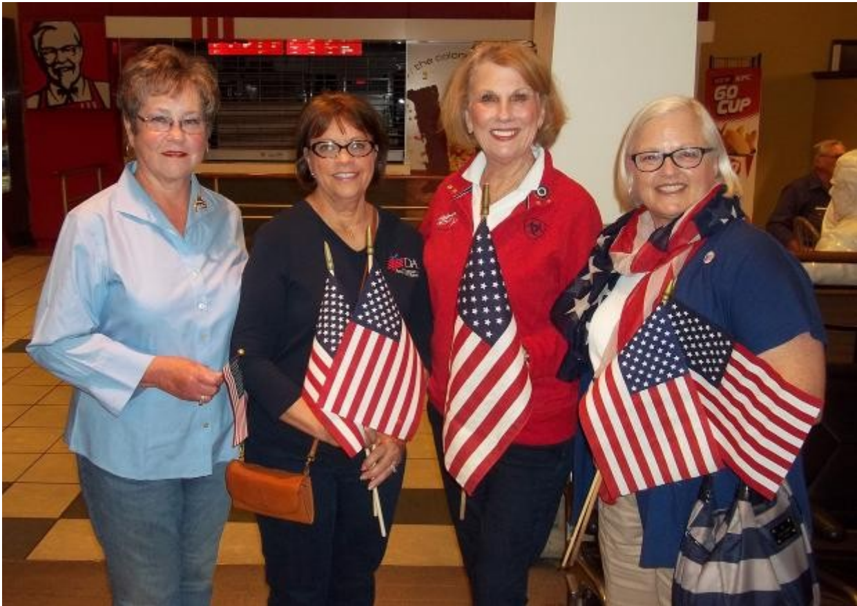
DAR members at recent Honor Flight