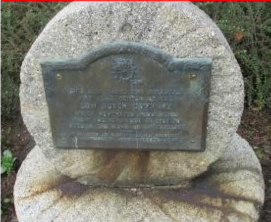
This marker was stolen, found and now back at the Low-Dutch Meeting House.