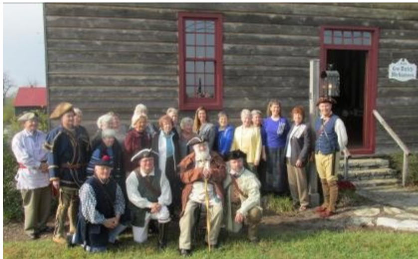
Group picture of DAR & SAR members.