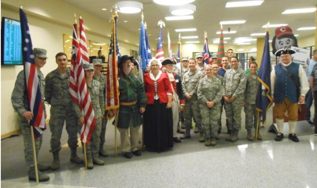
A local JROTC unit joined members of the Simon Kenton Chapter at a Northern Kentucky Honor Flight.