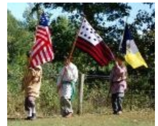
Flags being posted.