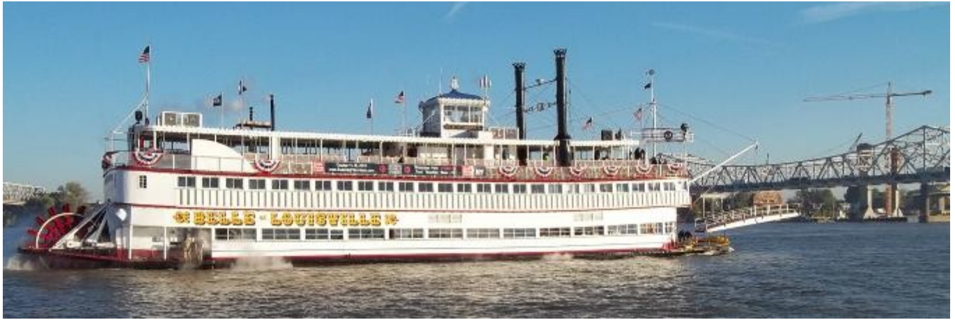
Belle of Louisville's 100 year old celebration