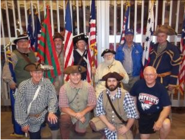
Gov. Isaac Shelby Chapter members at Honor Flight.