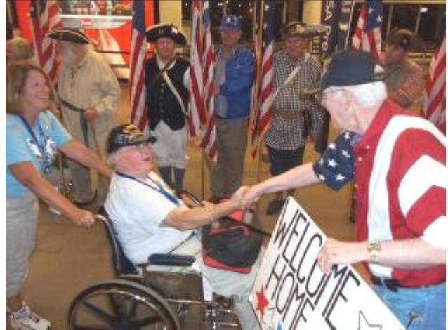
Honor Flight reception line.