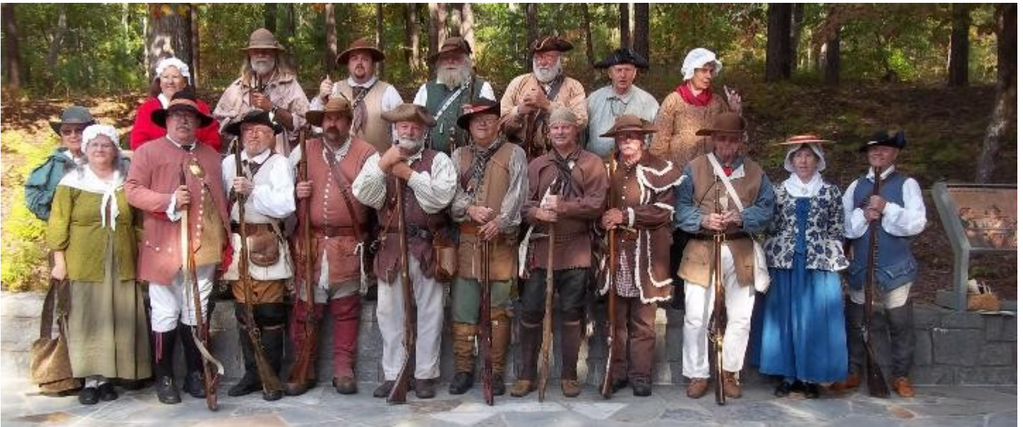
Group picture of those that traveled the over-mountain Victory Trail to get to Kings Mountain.