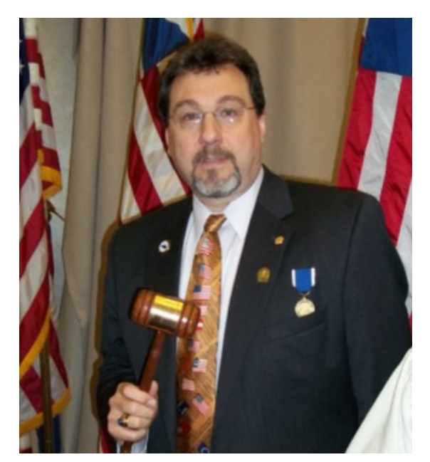
The gavel is passed!