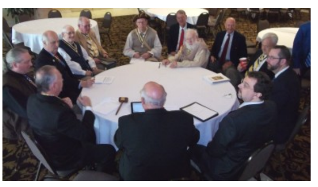
Board of Governors meeting