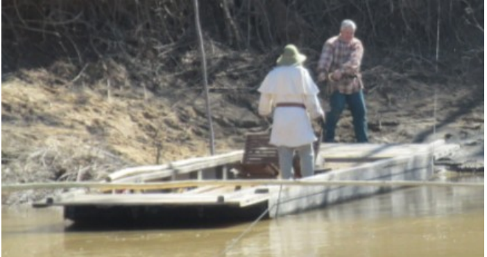
Cannon used during the ceremony and the flat boat ready to ferry Patriots across the Dan River.